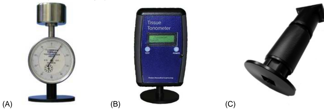
Figure 1: (A) Mechanical Tonometer (B) Electronic Tonometer and (C) Viscoelastic Tonometer.

This pilot study indicates that the electronic tonometer will be a good replacement of the mechanical tonometer making the measurements easier and more reliable and indicates that the VE tonometer is easily able to measure and differentiate viscoelastic properties of a range of materials approximating human tissues and their changes and should be investigated further on patients with lymphoedema.